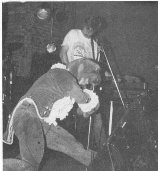
Local band Dear John put on an exhibition of amphibious fun at the 7-band WMSE Benefit.